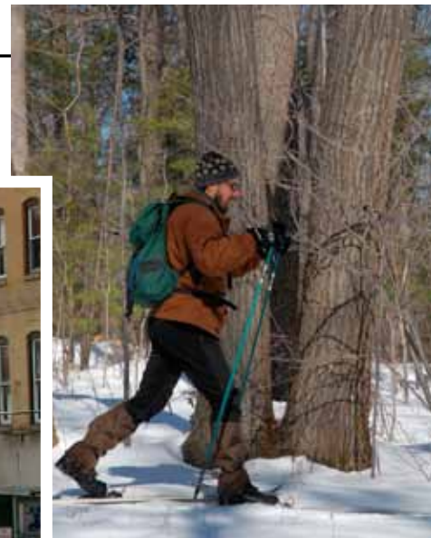
▲ THE 'BURG, FLIPPED: Counterclockwise from above: cross-country skiing; Heritage Days, the dining room at the 1921 Restaurant at The Philips Hotel.