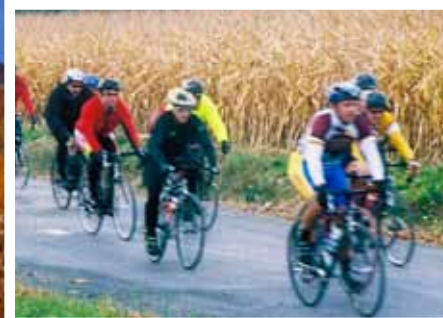
◀ RENAISSANCE PERIOD: Counterclockwise from above: riders in the Chilli Challenge; a scenic shot of Danville; Mill Street.